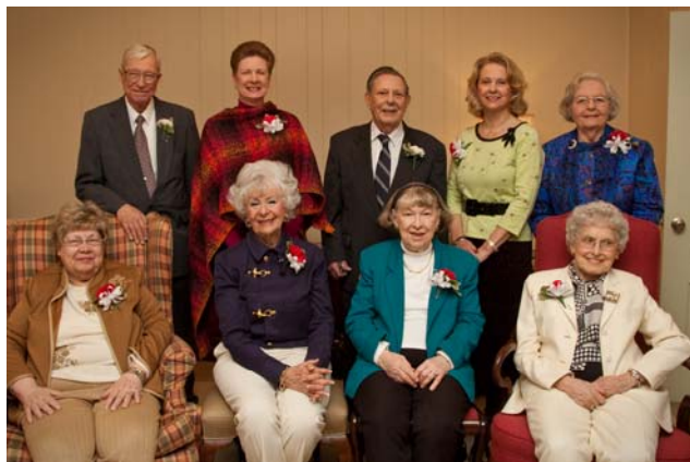
Faith's Charter Members attending the January 18th Worship Service