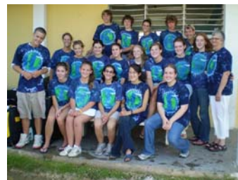
2008 Youth Work Trip Team

Please join us this year for what is always an entertaining and fun-filled evening for worthy causes.